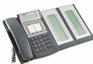
Display Panel Unit ( DPU)

There are two different extra key panel options: Key Panel Unit (KPU) and Display Panel Unit (DPU). The phones can be equipped either with up to three KPUs providing 72 extra keys, or with up to two DPUs, providing 48 extra keys.