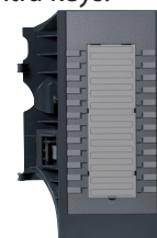
Key Panel Unit (KPU)